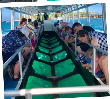
Glass Bottom Boat